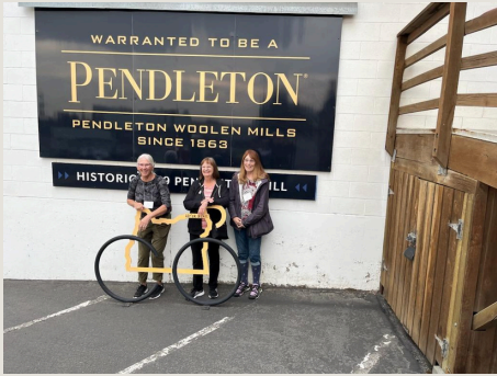
Pendleton, OR: Woolen Mills and Rooster's (for dinner)