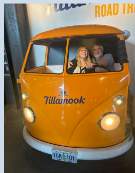
Newport, OR Oregon Coast Aquarium