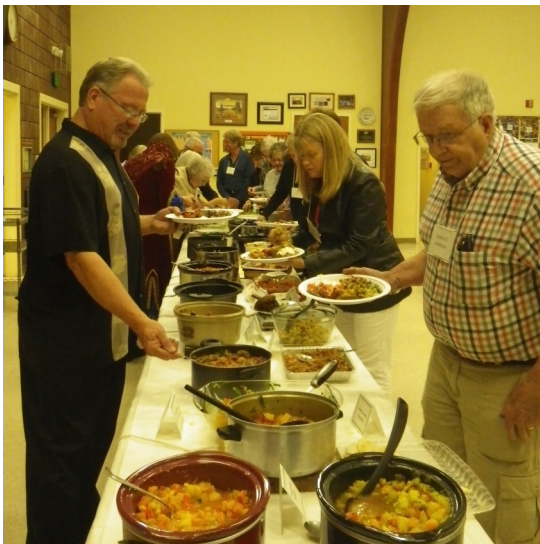
FFL Cultural Cuisine, Middle East November 7, 2016