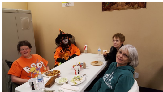
FFL Pinochle, Halloween Fall Semester, 2016