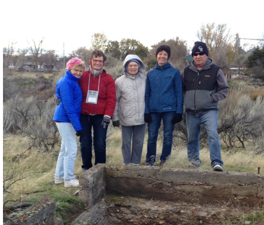
FFL HWE Walking Group Fall Semester, 2016