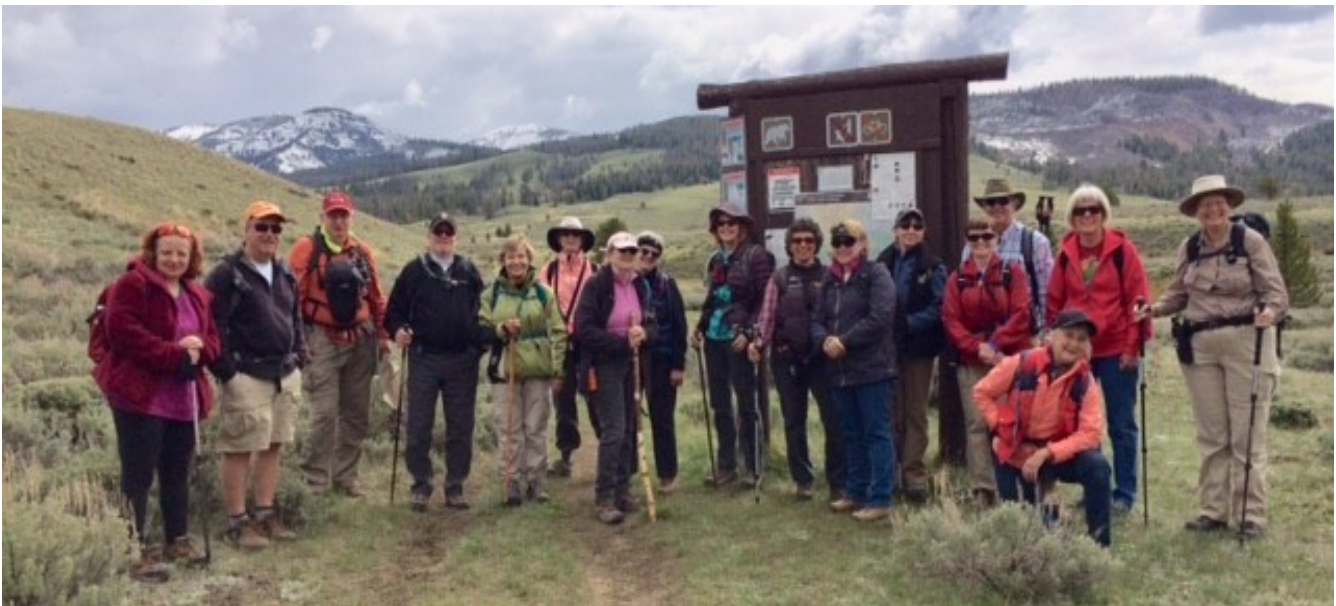
HWE Hike to Daly Creek, Yellowstone National Park

So, if anyone is interested in participating but has not registered for the HWE class, please consider doing so during our next semester registration.