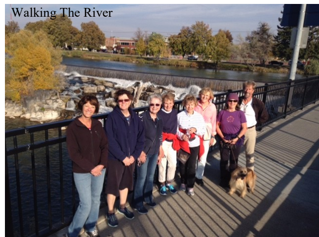
Walking The River