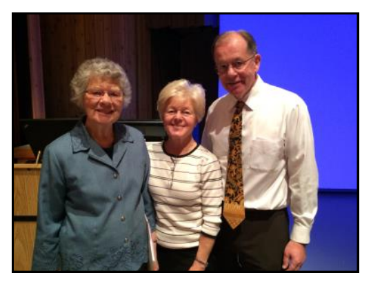
Scenes of early Idaho Falls 2-24-16