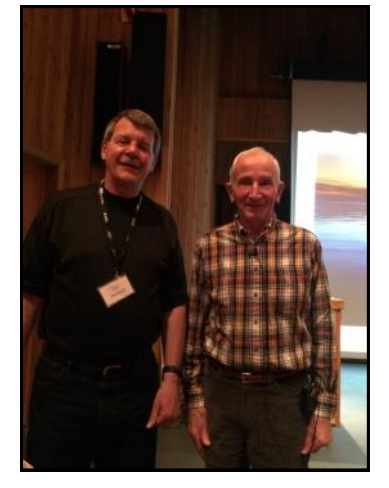
Climate Change Dynamics 2-10-16