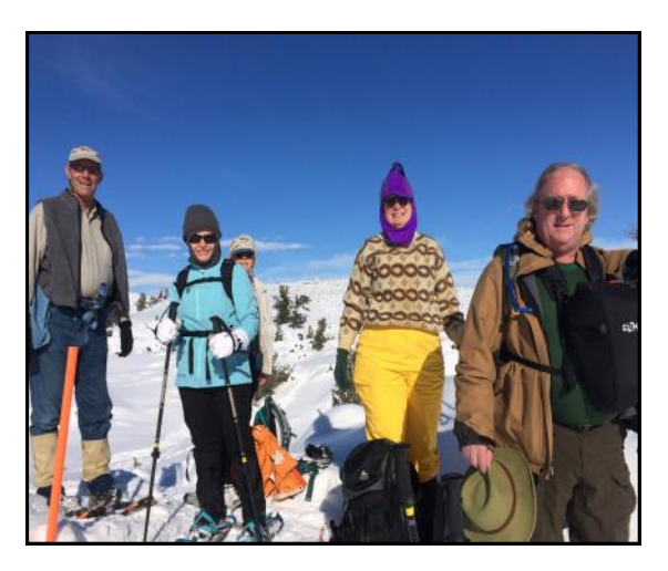
Snowshoeing Craters of the Moon 1-15-16