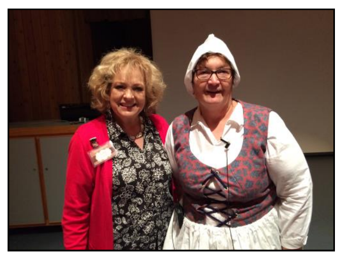
Mayflower Traveler 11-20-15